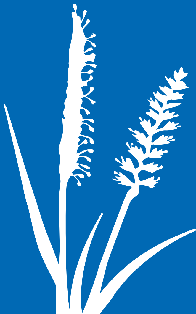
Figure 15.1 illustrates the structure of a plant, showing the main stem and the branching structure of the inflorescence.